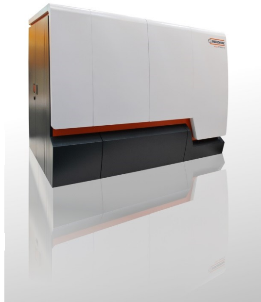
3D-Micromac provided a system with ultrashort-pulse laser as experimental object.

3D-Micromac AG is a leading manufacturer of highly-efficient machines for laser micro-processing. To ensure the environmental and health compatibility of the process, 3D-Micromac has been working successfully with ULT AG for a long time. For these investigations they allowed us use their new ultrashort-pulse laser structuring system. The results have shown that the parameter repetition rate and distance between capturing device and processing location are the decisive factors for the emission of particles and their removal. The tests clearly show that while the danger of the emission of respirable fine dust particles does exist, effective capture and filtration prevents this. The maximum particle size distribution lies at around 100 nm. With increasing laser performance, the number of particles rises as expected. The filter combination of cleanable cartridge filter and large surface area H13 pocket filters is very suitable for separating particles that are released during the processing of stainless steel. The separation efficiency for particles >34 nm is almost 100 per cent.