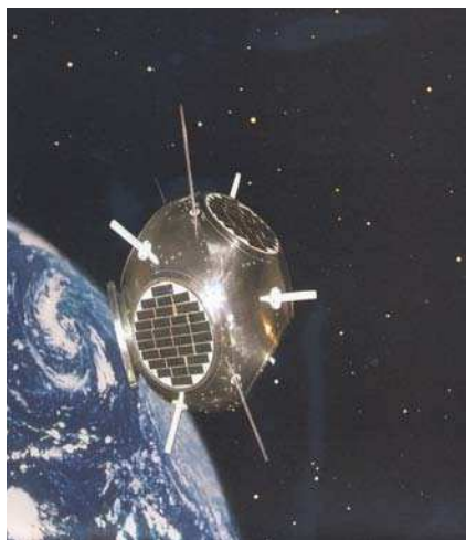
Early GRAB satellite for ELINT signal collection from ground radars

One of NSA's new responsibilities was to prepare a National ELINT Plan (NEP) in coordination with the ELINT community at that time. The first plan was completed in 1963 under NSA leadership with the participation of the US military departments, the Joint Chiefs of Staff (JCS), DIA, and CIA. Several plans followed.