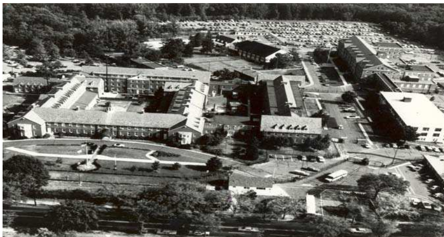
Naval Security Station (NSS) at Nebraska Avenue in Washington, DC, home of the NTPC

AFCIN-Z; it was housed in Building 20 at the Naval Security Station in Washington, DC. In addition to Army and Navy participation, the NTPC had key participants from the USAF and from the CIA. CIA at that time was operating the U-2 airborne reconnaissance program, and it led the integration of U-2 data into NTPC signal processing efforts. The U-2 had ELINT signal collection packages as well as photographic sensors.