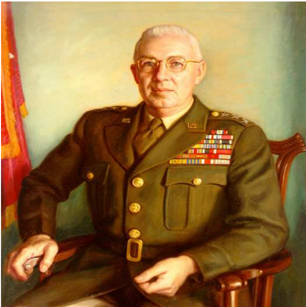
Lieutenant General Ralph Canine, USA, first Director of NSA

Department of Defense ELINT, however, was as much in need of coordination and management as COMINT. In particular, the effort badly needed a cohesive signal analysis and processing effort.