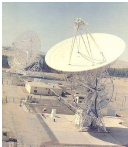
Now-closed STONEHOUSE deep space TELINT facility

In 1960, two major overseas ELINT processing centers became integral parts of the overall DoD ELINT structure NSA developed. These centers processed and analyzed data primarily from the US military departments' ELINT collection assets. In 1974 the USAF Europe sponsored programs with NATO partners and was fully integrated into the NSA system. Later this effort was combined with the NSA engineering support office in Europe.