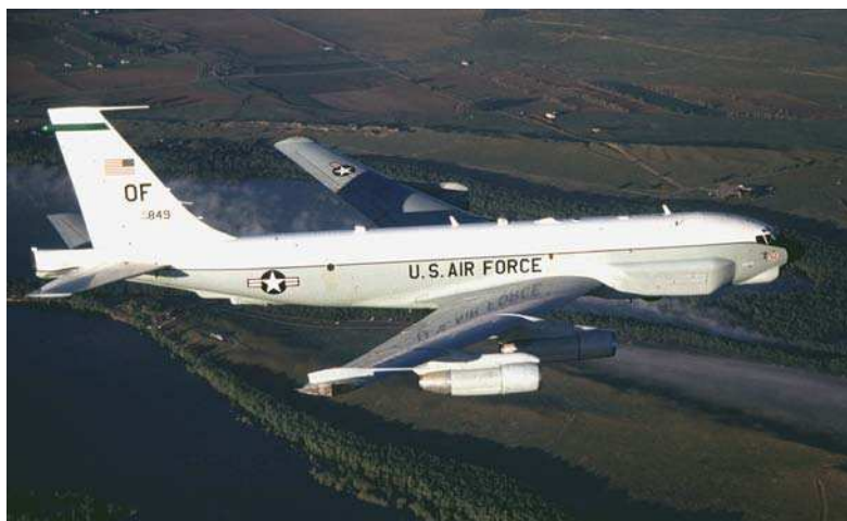
Modified RC-135U advanced ELINT airborne collection platform

TechELINT specially configured aircraft is ELINT reconnaissance and surveillance. They collect, analyze, and sometimes locate foreign target electronic signals to help determine detailed operating characteristics and capabilities. They have been in operation, with a continuing series of advanced configurations, since 1964.