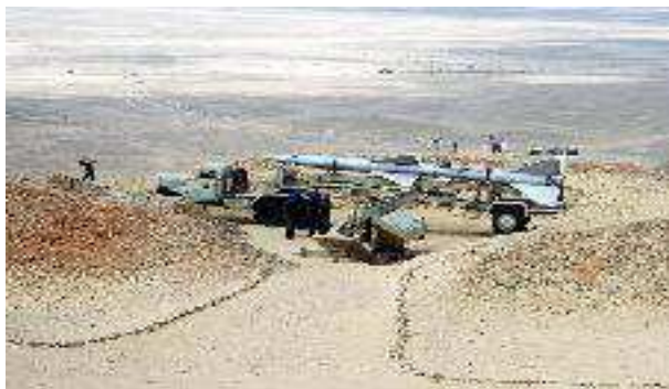
SA-2 “Guideline” ground-to-air missile system

and its reporting responsibilities to NRO activities, provided many collection and processing advantages, and improved timely reporting of NRO collection results.