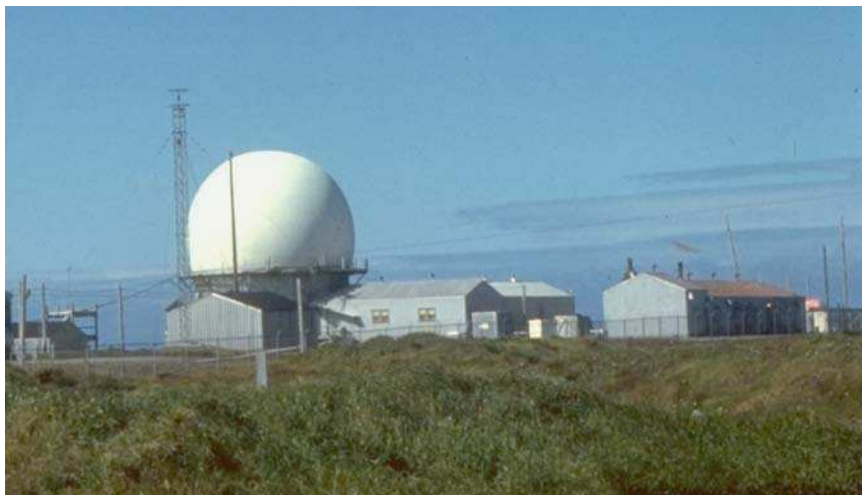
Now-closed 1970s missile and space TELINT facility

TechELINT specially configured aircraft is ELINT reconnaissance and surveillance. They collect, analyze, and sometimes locate foreign target electronic signals to help determine detailed operating characteristics and capabilities. They have been in operation, with a continuing series of advanced configurations, since 1964.