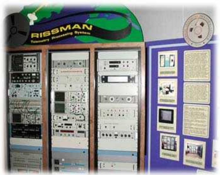
RISSMAN, a special-purpose telemetry processor

Different types of equipment sets were needed to process and analyze different forms of telemetry used by various telemetry transmission equipment. One example is RISSMAN, a special-purpose telemetry processing system used at NSA during the Cold War.