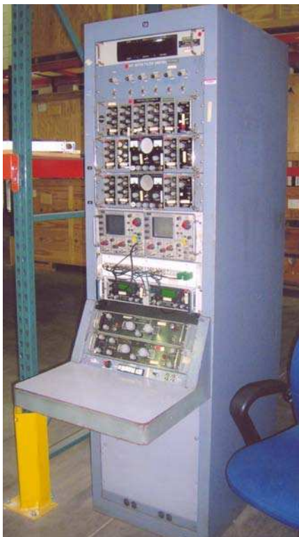
TELINT signal collection position in early 1970s

National Security Council Intelligence Directive No.6 was updated in 1972 and retitled “Signals Intelligence (SIGINT).” This directive gave NSA even more ELINT powers. Based on NSCID 6 concepts, SIGINT within DoD had been implemented by Department of Defense Directive 5100.20, issued in 1971 and commonly referred to as the “NSA Charter.” The DoD Directive charged NSA with the responsibility of managing SIGINT within DoD and specifically defined SIGINT as including COMINT, ELINT, and TELINT. As previously mentioned, the term TELINT has fallen into disuse and has been replaced by the term FISINT, which includes telemetry, missile and satellite command signals, and beacons.