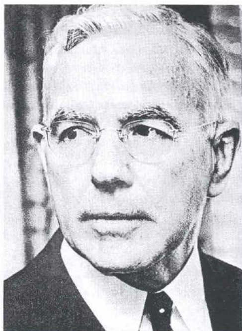
John McCone, Director of Central Intelligence during the Cuban Missile Crisis

offensive missile installations. Others in the defense and intelligence communities dissented from this opinion.