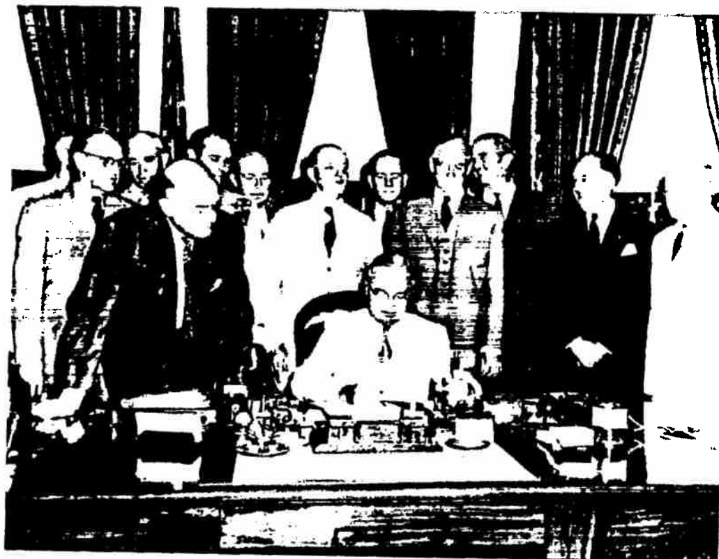
President Truman signing amendments to the National Security Act of 1947

president, the Secretary of State (Dean G. Acheson), Secretary of Defense (James V. Forrestal), and the chairman, National Resources Board. Optional attendees, depending upon the subject matter, were the secretaries and under secretaries of other executive departments and the military departments, the chairman of the Munitions Board, and the chairman, Research and Development Board. 17 The initial membership of the NSC did not include the DCI.