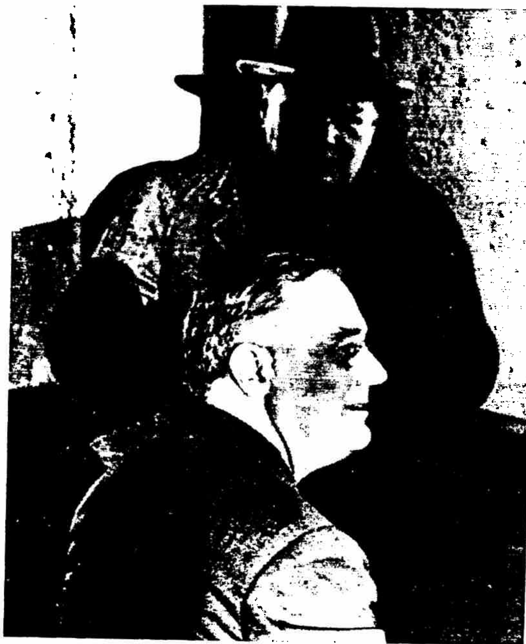
Franklin D. Roosevelt and Winston Churchill established a direct channel of personal communications in 1940, reinforcing strong ties between the United States and Great Britain.