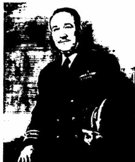
Admiral Sidney W. Souers Executive Secretary, NSC