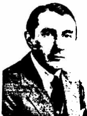
William H. Jackson