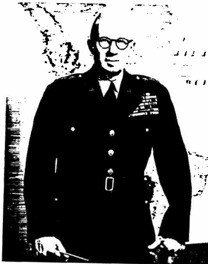
Major General Ralph J. Canine

take issue with some aspects of the report. The committee had proposed an extension of the responsibilities of AFSA to include a communications security responsibility for the entire United States government rather than merely the Department of Defense, as was then the case. Canine agreed in principle with the proposal but pointed out that the committee had included very little on communications security in its report. He recommended that the proposed directive be confined to COMINT, with communications security to be made the subject of another study and to be addressed in a separate directive. Canine also argued strongly against retention of the rule of unanimity - even for COMINT matters outside the jurisdiction of AFSA. He pointed out that this would only serve to perpetuate one of the chief difficulties that had hampered USCIB in the past. He urged the acceptance of a majority-rule principle to govern all USCIB decisions. Lastly, Canine pointed out that the Brownell Report had omitted the generally accepted