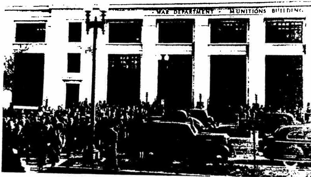
War Department Munitions Building

Leaving nothing to chance in their advance preparations, Army and Navy officials held a number of closed meetings prior to the meeting of the full committee. They sought primarily to resolve their long-standing disagreement on coverage of diplomatic targets. Five days before their meeting with the FBI, the Army and Navy succeeded in reaching an agreement on the division of COMINT responsibilities between their organizations. 21 The solution, urgently promoted backstage, resolved the nagging question of how to allocate service responsibility for diplomatic traffic. At the Navy's request, on 25 June 1942 the Army-Navy participants agreed to transfer the entire diplomatic problem to the Army for the duration of the war.