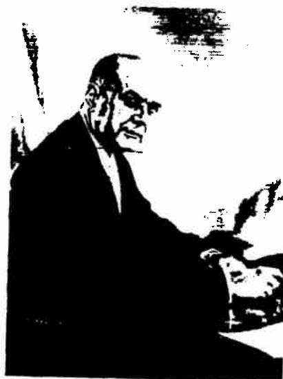
Louis A. Johnson, Secretary of Defense

Traditionally, the Army and the Navy held divergent views on the use of civilian personnel in manning their COMINT organizations. Reliance on civilian personnel represented no major change for the Army. Throughout the 1930s the Army recruited high-level mathematicians as well as civilians with other technical skills for its cryptologic organization. During World War II, the Army continued to rely on a large civilian work force. In contrast, at the conclusion of the war, the Navy COMINT organization employed only about seventy civilians out of almost eleven thousand persons. 2 The latter, however, did include a large number of engineers, scientists, and college professors who became