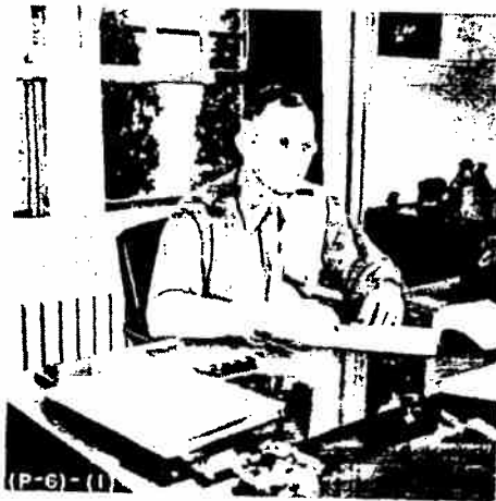
Colonel W. Preston Corderman, USA