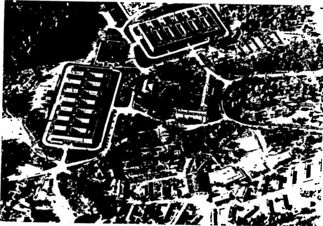
Aerial view of Arlington Hall Station

Coincidental with the negotiations over the allocation of cryptanalytic targets and in anticipation of new and greatly expanded operational missions, each service initiated search actions for the acquisition of new sites to house their already overcrowded facilities. Within one year, the services accomplished major relocations and expansions of their operations facilities within the Washington, D.C., area.