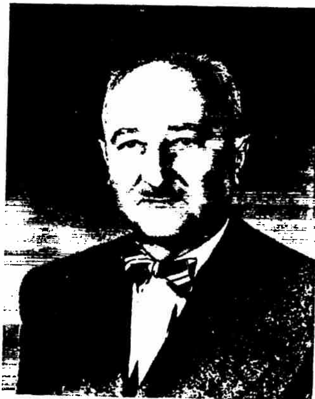
William F. Friedman