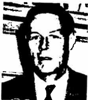
Charles E. ("Chip") Bohlen