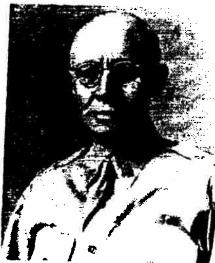
Major General George V. Strong Assistant Chief of Staff, G-2