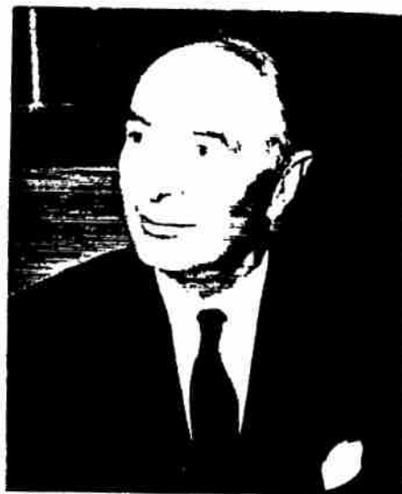
Robert Lovett, Secretary of Defense

With Lovett's memorandum, Canine acquired a new relationship with the military services and their COMINT activities. Theoretically, he now had control over all COMINT collection and production resources. Canine started a four-year term of office as the director of NSA on 4 November 1952. In accordance with its new charter, he received a third star. Each of the services assigned one or two two-star grade officers to the new agency. This change was consistent with Truman's decision to elevate the status of the unified agency. The reorganization of AFSA removed the COMINT structure from exclusive military control and theoretically gave all intelligence agencies, military and civilian, an equal voice in the COMINT processing and requirements process.