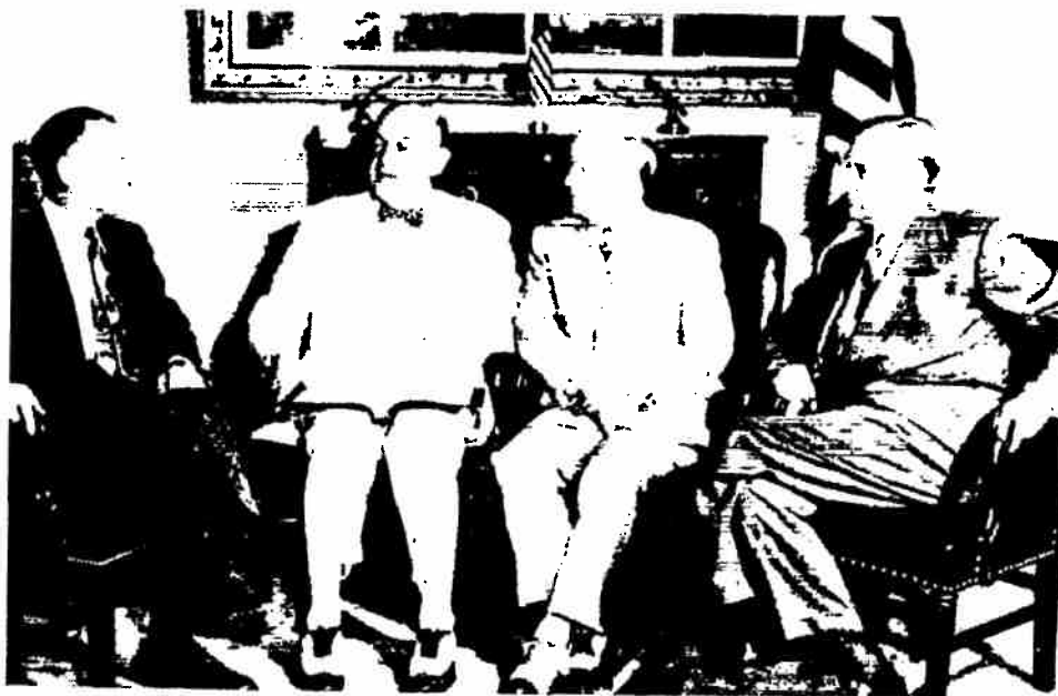
The Johnson Team

Thus, the atmosphere for cooperation and consolidation was volatile. However, by the time the vote on the AFSA merger took place, Johnson had appointed a new Secretary of the Navy, Francis P. Matthews, whom he had selected personally. 29 Matthews supported Johnson's position. As for the Air Force, Vandenberg, as Air Force Chief of Staff, had consistently and actively promoted the growth of the Air Force as an independent service. In addition to the commitment for an independent cryptologic arm for the Air Force, it is also likely that Vandenberg envisaged receiving greater financial support for aircraft programs if he went along with consolidation in other areas such as the merger of cryptologic activities.