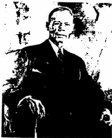
General Walter Bedell Smith, DCI