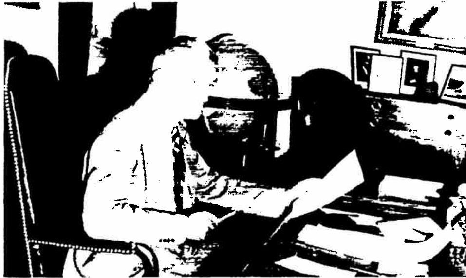
James V. Forrestal, First Secretary of Defense, 1947-1949