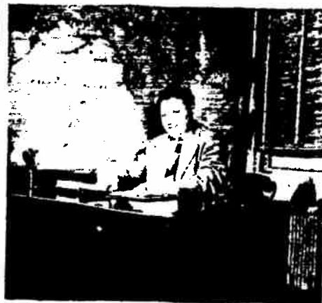
Dr. Solomon Kullback Chief, Research and Development Monitor Group