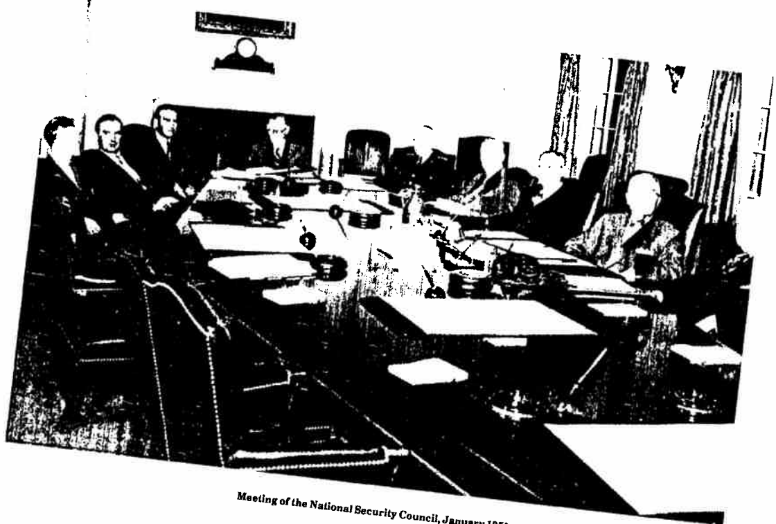
Meeting of the National Security Council, January 1951