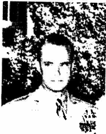
Lieutenant General Hoyt S. Vandenberg STANCIB Chairman

The COMINT organizations would coordinate their activities but would remain totally independent organizations. In addition to the integration of Army-Navy personnel on certain analytic problems, STANCIB divided the Army-Navy responsibility for [redacted] [redacted] targets along the traditional lines and identified the [redacted] communications as a "joint" responsibility, to be placed under the direction of the new Coordinator of Joint Operations. To implement this new concept of Army and Navy cooperation, STANCIB directed the Chiefs of ASA (Army Security Agency) and OP-20-G to draw up the details of a plan and statements of general principles governing the roles and responsibilities of the services and the Coordinator of Joint Operations. 23