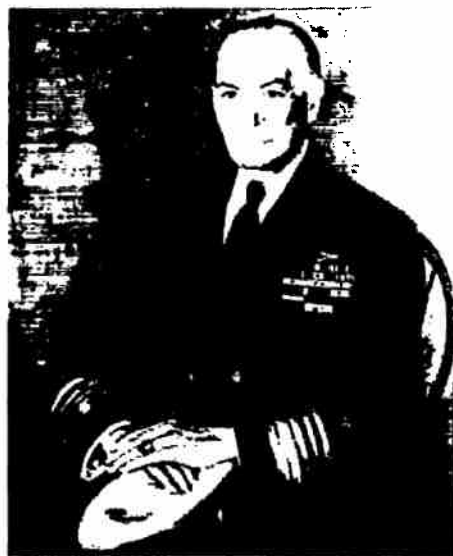
Admiral Roscoe H. Hillenkoetter Director of Central Intelligence